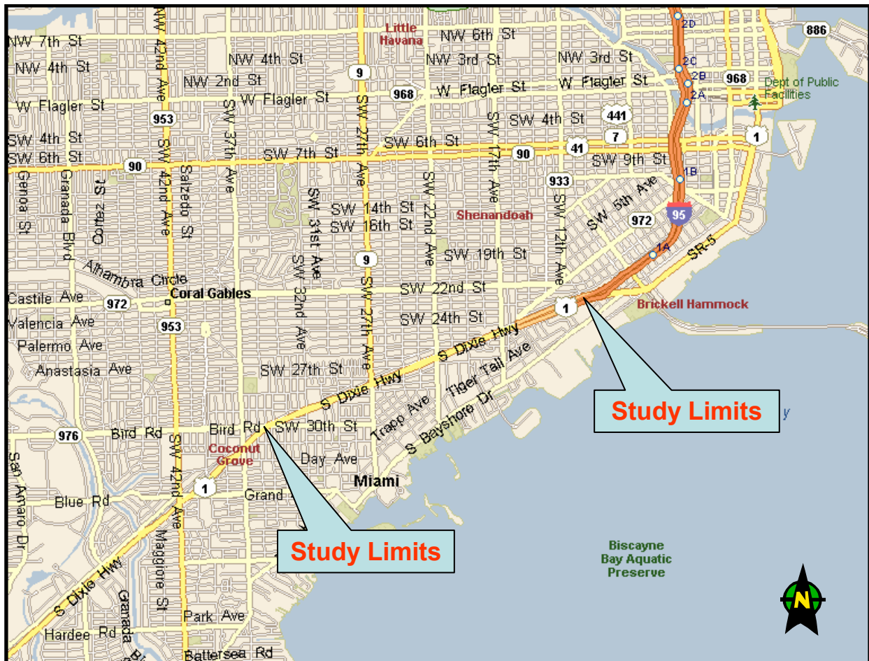
Figure S-1 – Project Location Map

A Planning Study was initiated to examine the existing safety and operations along the US 1 corridor, between SW 40 th Street (Bird Road) and Interstate 95 (I-95), in order to determine the impact on safety and corridor Level of Service (LOS), resulting from the potential addition of a reversible lane system. The Miami-Dade County Metropolitan Planning Organization (MPO) is currently evaluating the feasibility for the addition of a reversible lanes system which have successfully been completed and implemented in areas such as Charlotte, NC on Tyvola Road, Washington DC on Connecticut Avenue, Louisville, Kentucky on Bardstown Road and Covington, Kentucky on the Clay Wade Bailey Bridge. The study area extends approximately 2.6 miles south of the intersection of I-95 with US 1 within Miami-Dade County, Florida (See Figure S-1 Project Location Map).