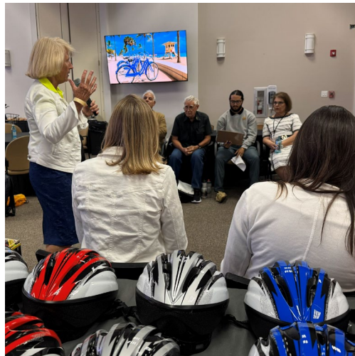
Figure 1: Photos of the Bike-Friendly Workshop held on May 2, 2025.