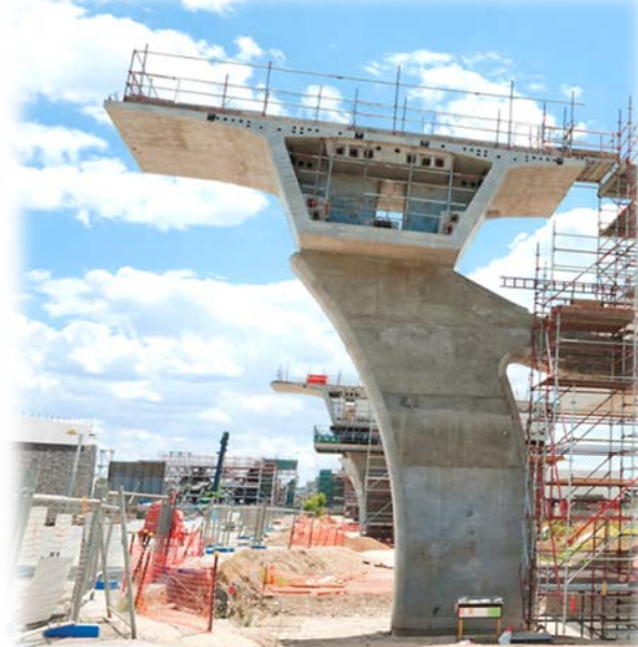
NW 25 Street Viaduct Construction