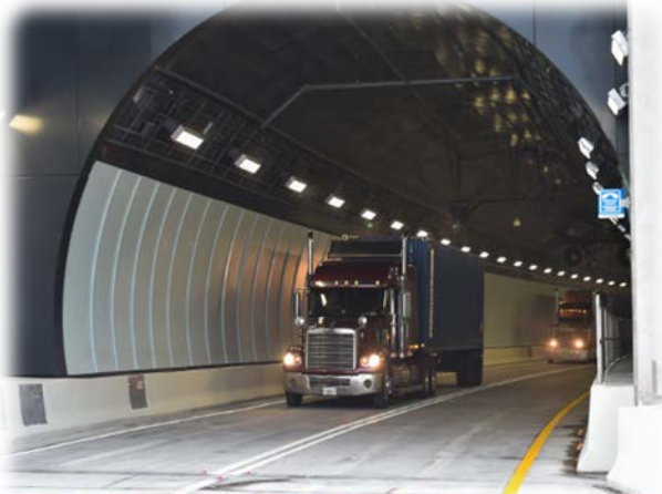
Trucks Exiting Port of Miami Tunnel