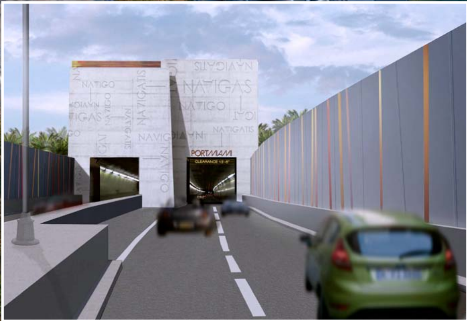
PORT TUNNEL RENDERING

The LRTP is important because it serves as the MPO's guide for long-term transportation planning. One component of the LRTP is the 2035 Cost Feasibility Plan, which supports highway, transit, and non-motorized improvements, as well as the expansion of High Occupancy Vehicle lanes along major expressways.