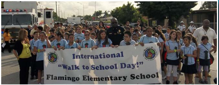
WALK TO SCHOOL DAY EVENT

Also in 2011, the Gold Coast Section of the American Planning Association, Florida Chapter, provided the Miami-Dade MPO the Award of Merit "Best Plan, Report or Study" for the production of the Bicycle/Pedestrian Mobility Plan for the Miami Downtown Development Authority.