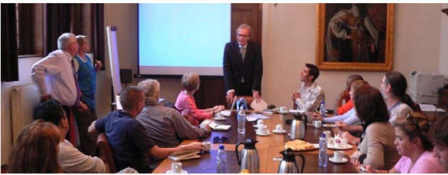
NETHERLAND'S BIKING CONFERENCE