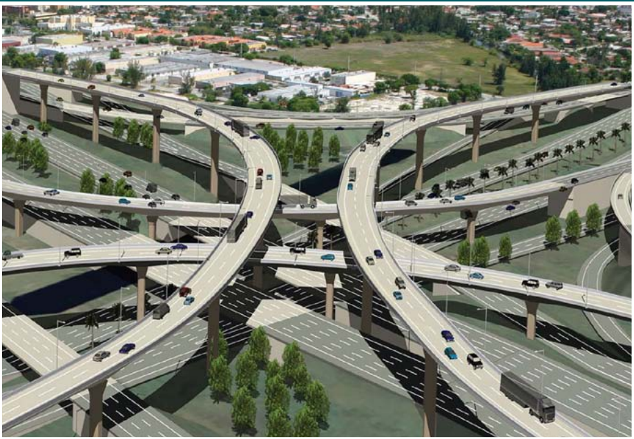
SR 836 - SR 826 INTERCHANGE RENDERING