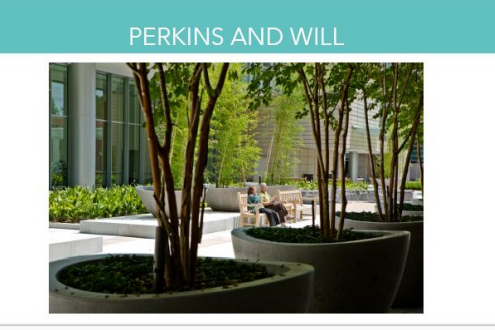
HEN-MOORE & ASSOCIATES