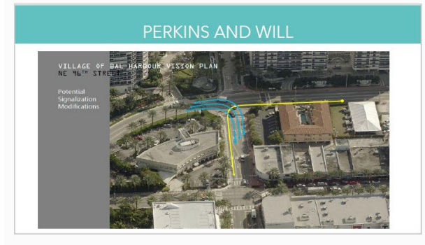
CHEN-MOORE & ASSOCIATE