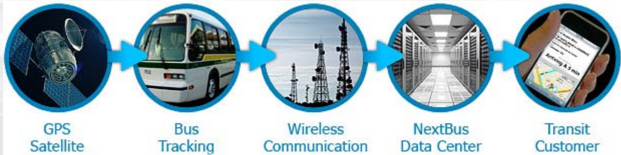
Figure 4-3 - NextBus Passenger Information System Information Flow

shelters and transit depots. Arrival information can be received by text through subscription. This concept is depicted in Figure 4-3 below.