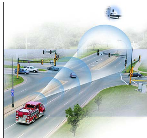
Figure 4-4 - Representation of Traffic Signal Priority System

Traffic signal priority (TSP) is a technology that either advances the green signal or delays the red signal in