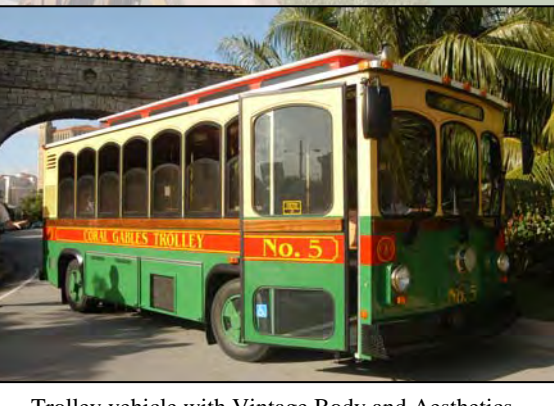
Trolley vehicle with Vintage Body and Aesthetics.

The area bounded by Flagler Street on the north, SW 8 Street on the south, Douglas Road to the east, and LeJeune Road on the west is predominantly residential and has a number of street closures to prevent cut-through traffic. However, Ponce de Leon Boulevard traverses the area providing a direct connection to the