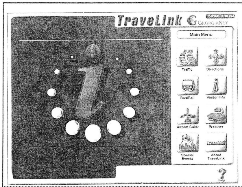
Figure 1: Opening Screen of the TravelLink Kiosk

The Advanced Traffic Management System (ATMS) project of Georgia Department of Transportation and Georgia Travel Showcase system project of Federal Highway Administration provide necessary information to the kiosks through GeorgiaNet.