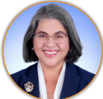
HONORABLE DANIELLA LEVINE CAVA Miami-Dade County Mayor