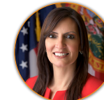
SPECIAL GUEST SPEAKER HONORABLE JEANETTE M. NUÑEZ Lieutenant Governor of Florida