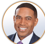
EMCEE JAWAN STRADER NBC 6 News Anchor