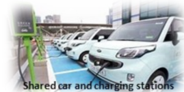
Shared car and charging stations

Your ideas can potentially be included in future transportation planning studies and plans to guide action towards those solutions