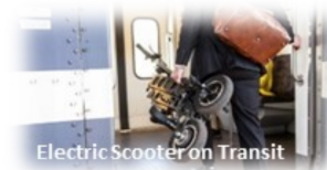
Electric Scooter on Transit