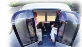
Automated vehicle/self-driving pod